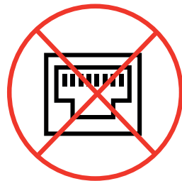
Toner & printer cartridges